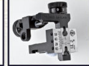
The HPS Convertible Rifle Stock

HPS is an HSE Licensed Commercial Manufacturer of ammunition since 1993. All HPS ammunition is CIP approved, packaged and labelled according to UN regulations for UK and International Transport. HPS are also Liability Insured.